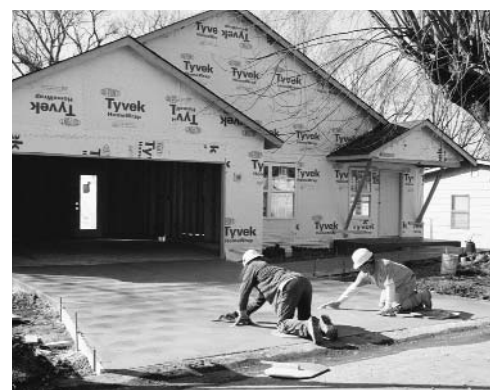
Work is progressing on the HBA-sponsored Habitat House in Wentzville for a family victimized by Hurricane Katrina.

This year, the HBA has taken on another large project and broke ground on a Habitat for Humanity home in Wentzville for a family victimized by Hurricane Katrina. To date, the HBA and its members have given more than $85,000 in cash, material, labor and services towards the completion of the house. n