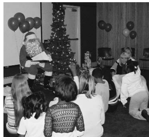
Santa read "The Night Before Christmas" and then passed out presents to all the kids.

During the months leading up to the party, SMC council members donated toward the event to help buy presents for the children. The council raised more than $1,200.